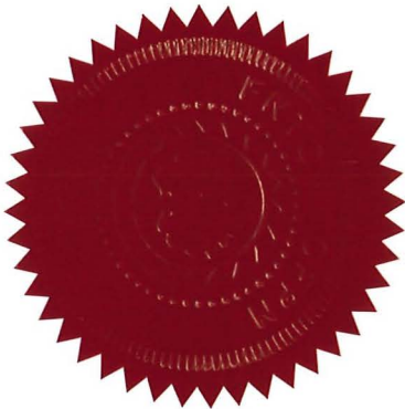
Chief Commissioner C.T. (Manny) Jules On behalf of the First Nations Tax Commission

Dated at Kamloops, British Columbia this 6th day of June, 2024.